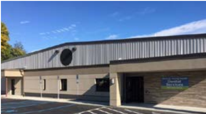
Exterior of the Albany Dental Clinic

The dental clinic is now located at 900 Lark Drive (across the street from the Albany Health Center).