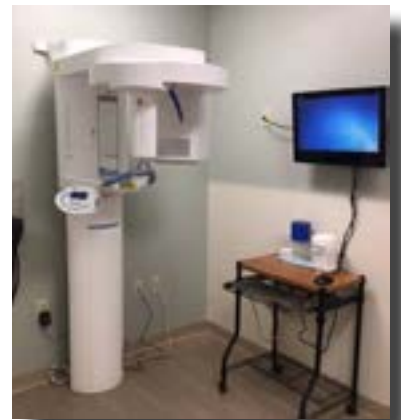
State-of-the-art X-Ray machine